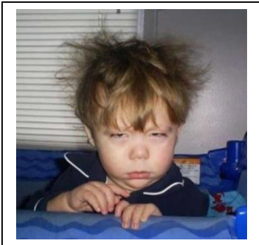
I don't need a hair stylist, my pillow gives me a new hairstyle every morning.